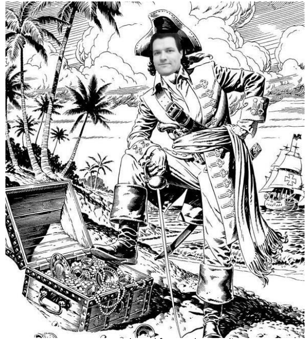
Adapted from redapestudio.com

We received their money to study the hydrogen storage capability of a carbon nanotubes (CNT) material functionalized with gamma radiation, and currently we have functionalized CNTs by chemical means (functionalization = create active sites in the surface of the CNTs). My student Jessika Rojas is actively pursuing this research line.